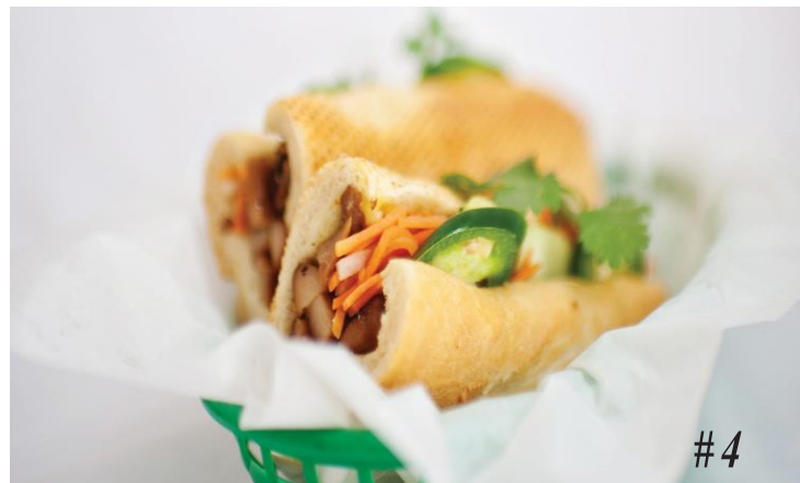
9. Gỏi Cuốn Tôm Thịt