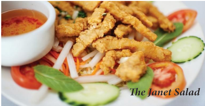
The Janet Salad